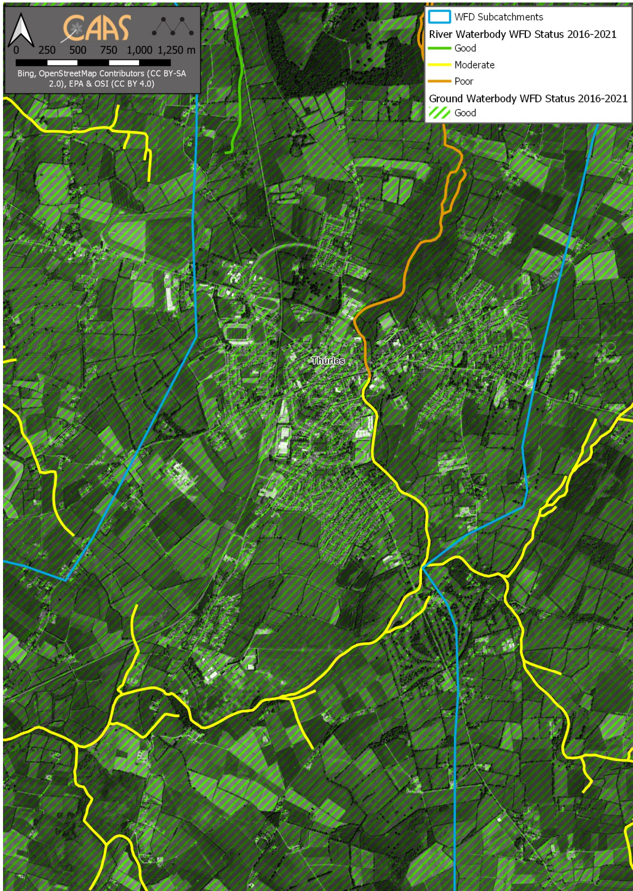
Figure 3.2 Surface Water Status (2016-2021)