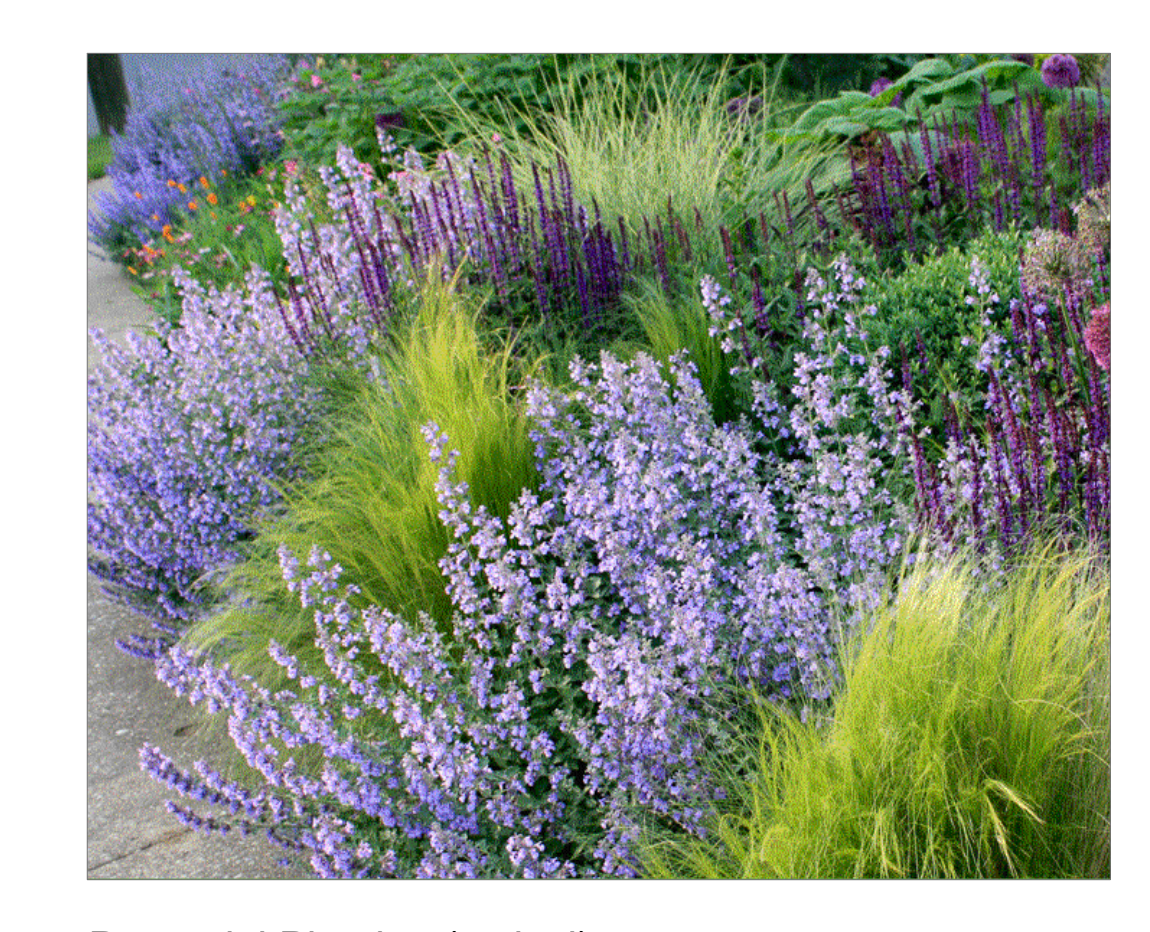
Perennial Planting (typical)