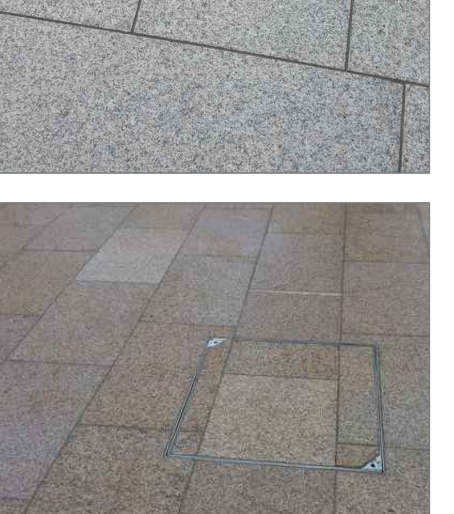
Feature Paving Areas Granite slabs, mixed-grey/buff Various sizes x 80mm th Bush-hammered finish