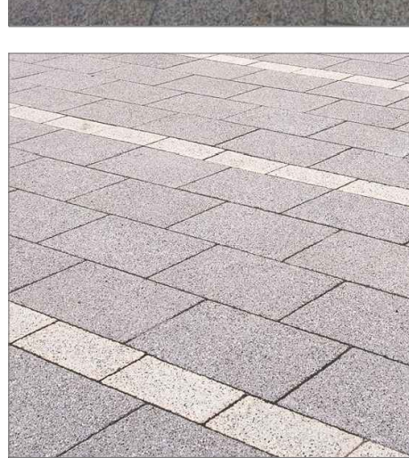
Secondary Pedestrian Areas PC concrete granite aggregate slabs Silver grey and mid-grey aggregate 600x400x80mm th and 400x400x80mm th Tobermore Fusion or similar