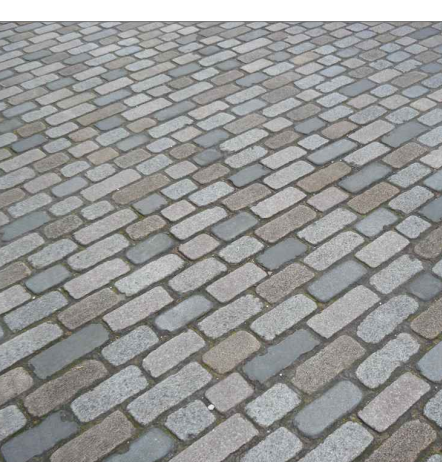
Trafficked Setts (Shared Surface) Granite, mixed colours and sizes x 150-180mm th Bush-hammered finish