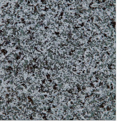
Mid-Grey Dark Grey