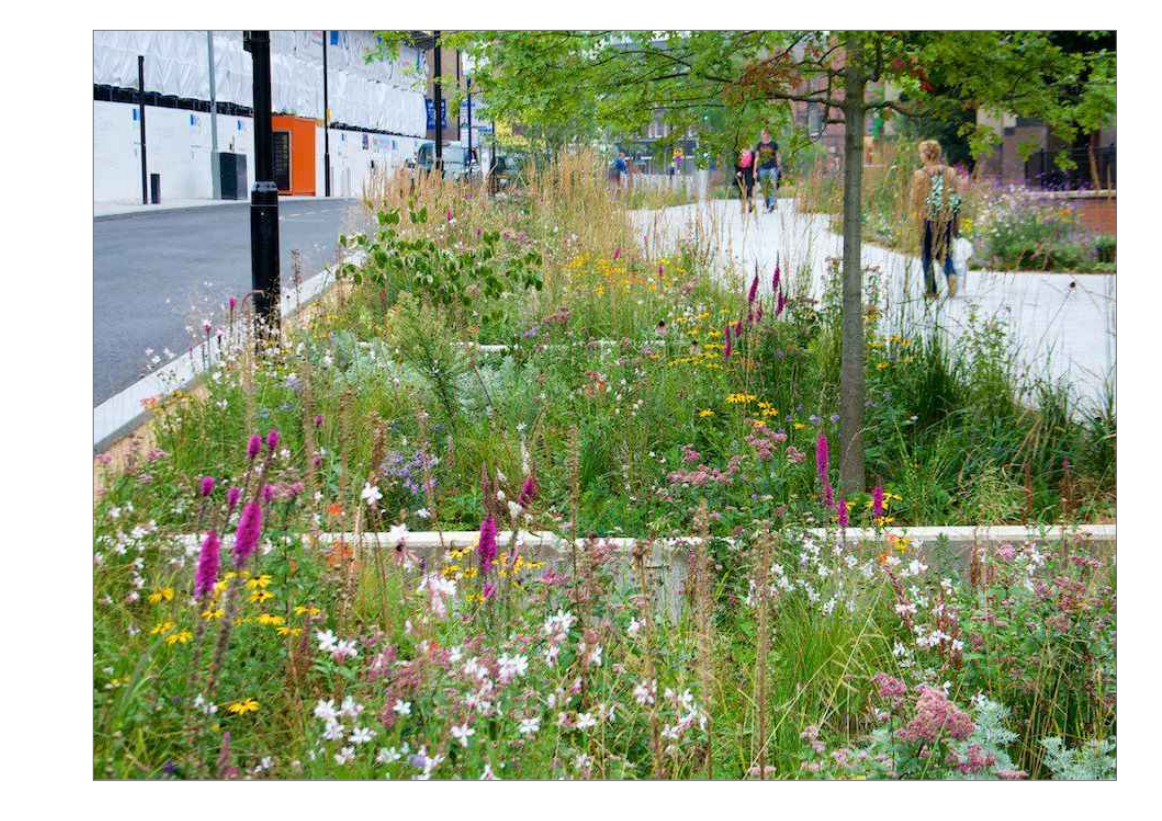
Rain Garden and Perennial Planting