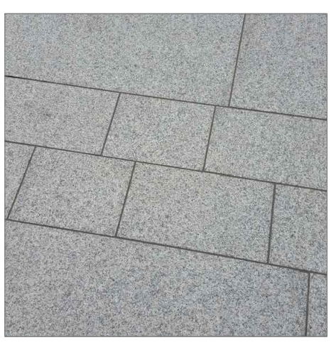
Main Pedestrian Areas (The Square) Granite slabs, silver grey with mid-grey bands Various sizes x 80mm th Bush-hammered finish