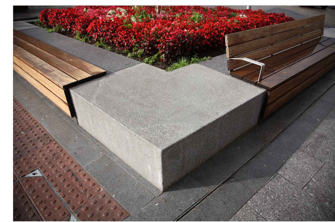
Raised Planters with Seating