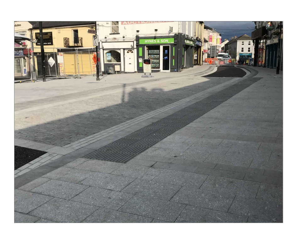
Kerbs - Flush and Raised - Irish Limestone