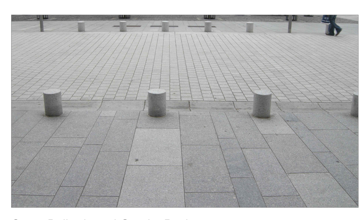
Stone Bollards and Granite Paving