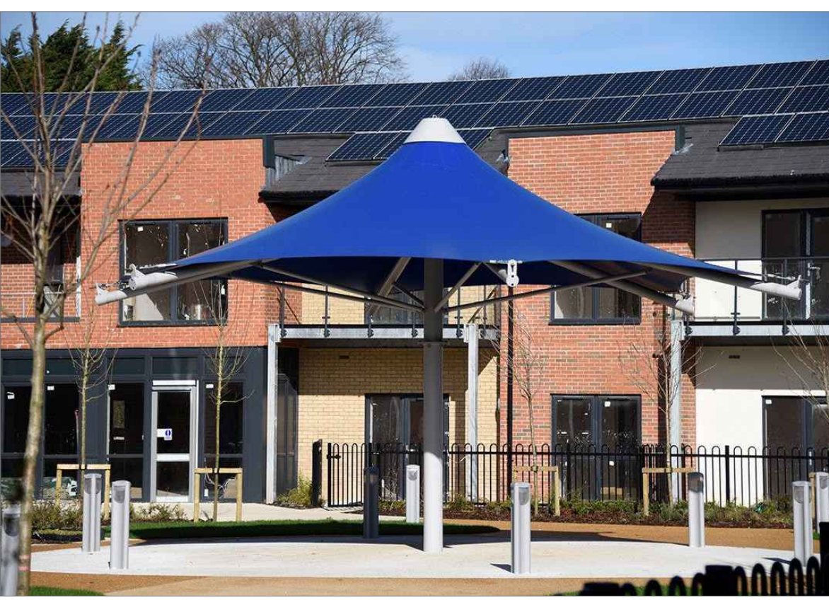
Tensile Canopy Structure