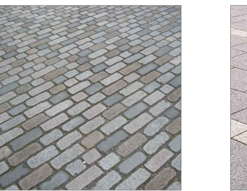
Shared Surface/ Vehicular Paving Granite, mixed colours and sizes x 150mm th Bush-hammered finish