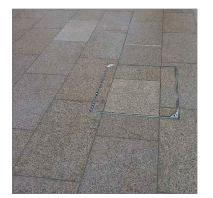
Feature Paving Granite slabs, mixed-grey/buff Various sizes x 80mm th Bush-hammered finish