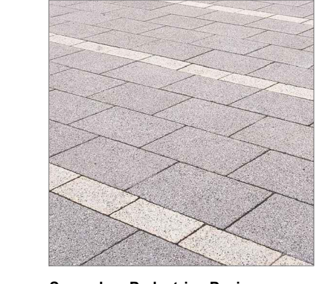
Secondary Pedestrian Paving PC concrete granite aggregate slabs Silver grey and mid-grey aggregate 600x400x80mm th and 400x400x80mm th Tobermore Fusion or similar