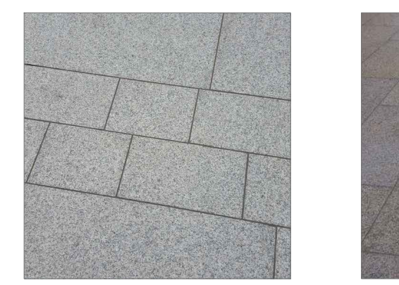
Primary Pedestrian Paving Granite slabs, silver grey with mid-grey bands Various sizes x 80mm th Bush-hammered finish