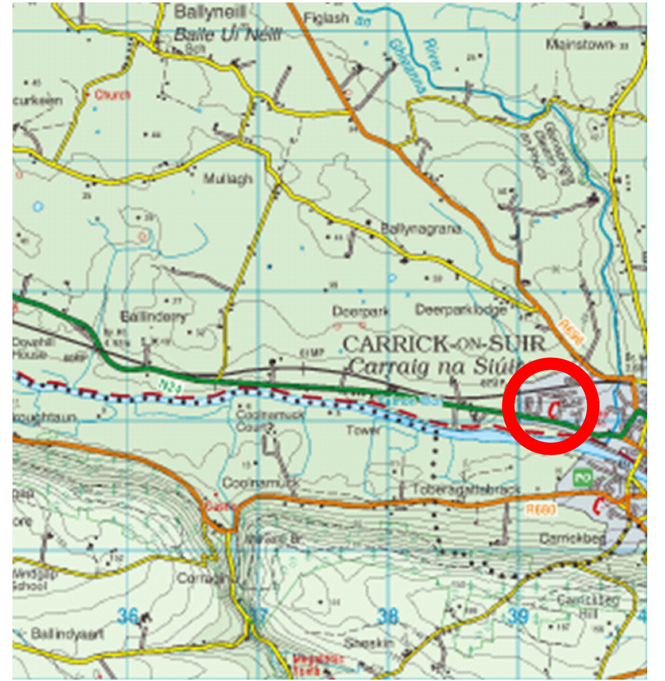
OS MAP NTS