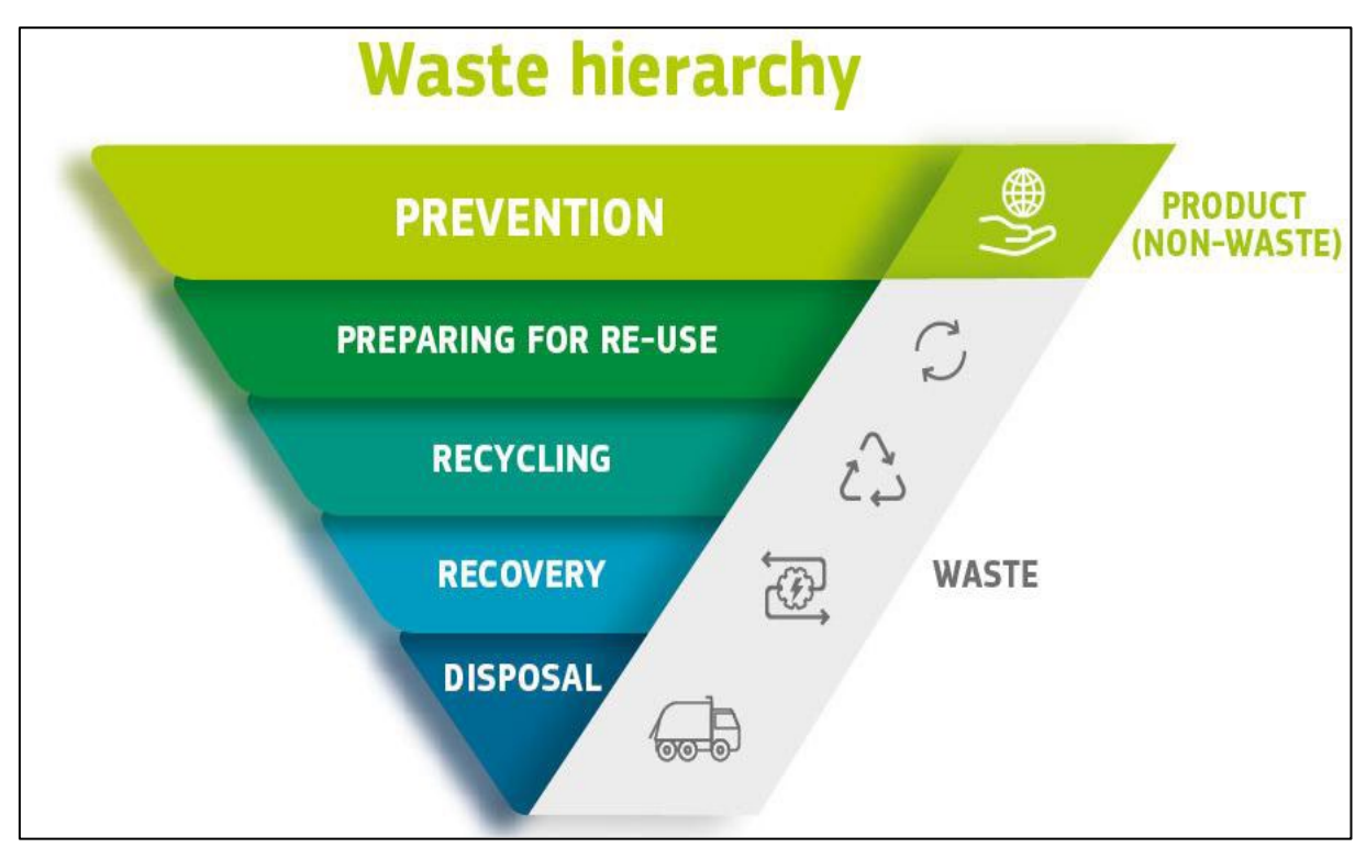
Figure 13-1: Waste Hierarchy

Waste management in Ireland is subject to EU, national and regional waste legislation and control, which defines how waste materials must be managed, transported and treated. The overarching EU legislation is the Waste Framework Directive (2008/98/EC) (as amended) which is transposed into national legislation in Ireland by the European Communities (Waste Directive) Regulations 2011 (as amended). The cornerstone of Irish waste legislation is the Waste Management Act 1996 (as amended). European and national waste management policy is based on the concept of 'waste hierarchy', which sets out an order of preference for managing waste (prevention > preparing for reuse > recycling > recovery > disposal) (Figure 13-1).