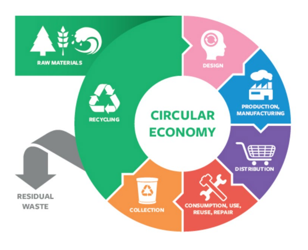
Figure 13-2: Circular Economy

Transport Infrastructure Ireland (TII) published The Management of Waste from National Road Construction Project in December 2017. The document is intended to assist all parties - designers, local authorities, contractors, etc. – on how the challenge of effective waste management is to be met in a road-building context. In particular, the document will: