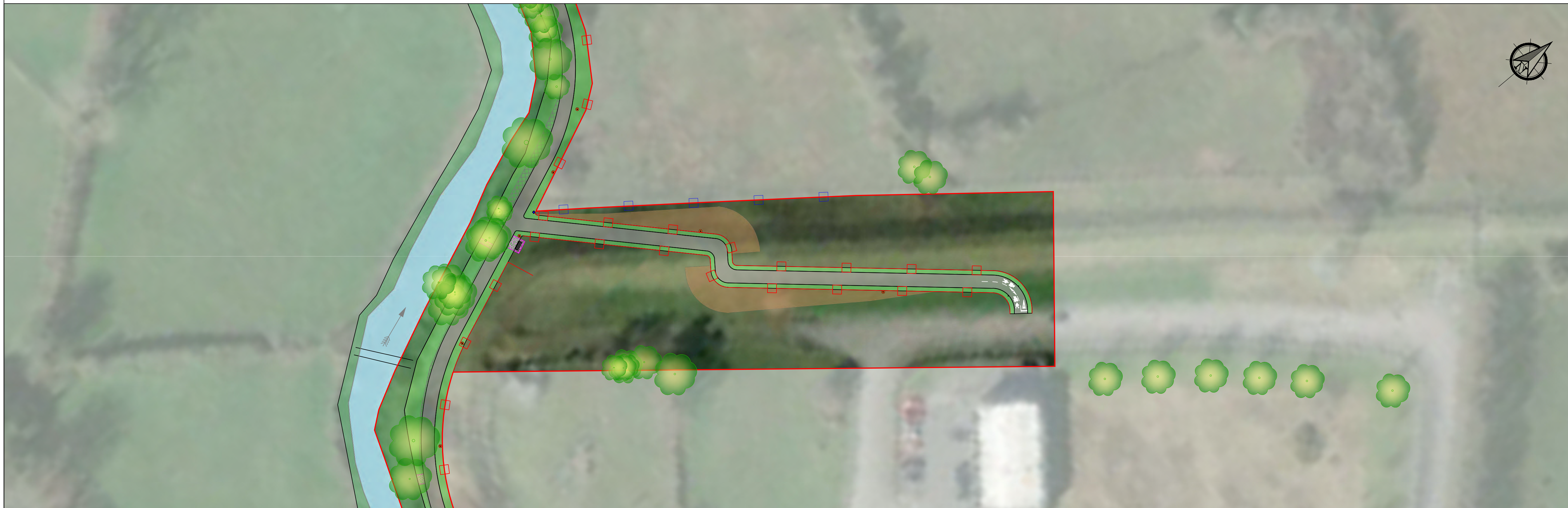
VIEW 1B Scale 1:500