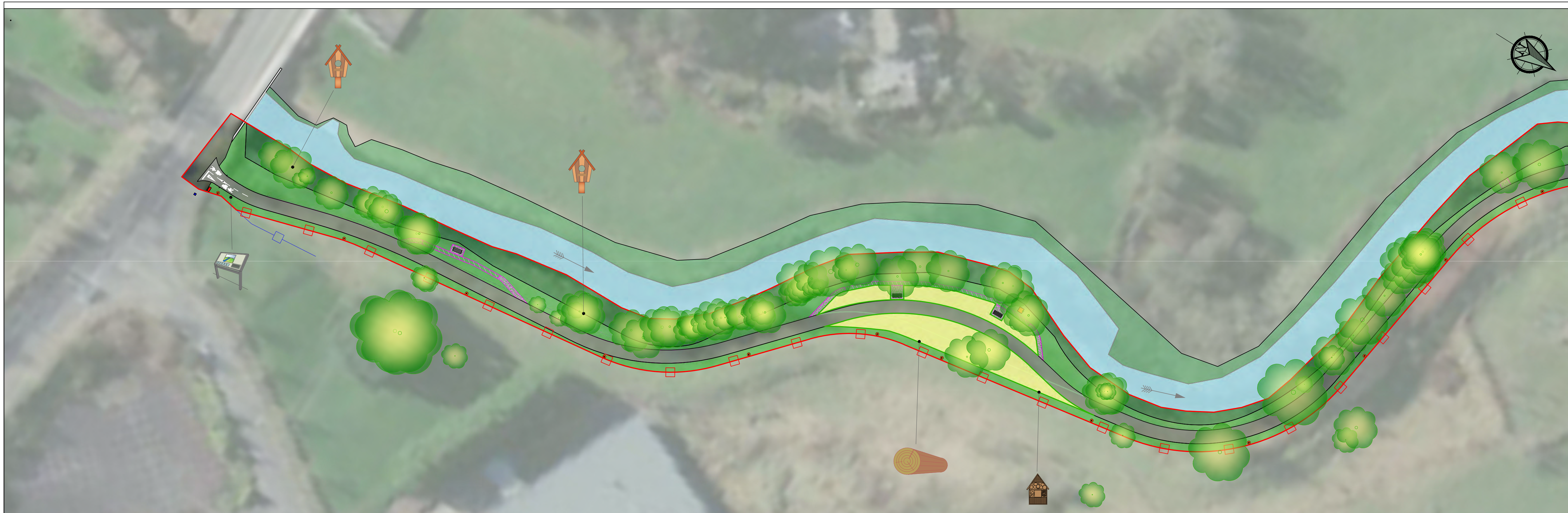
VIEW 1A Scale 1:500