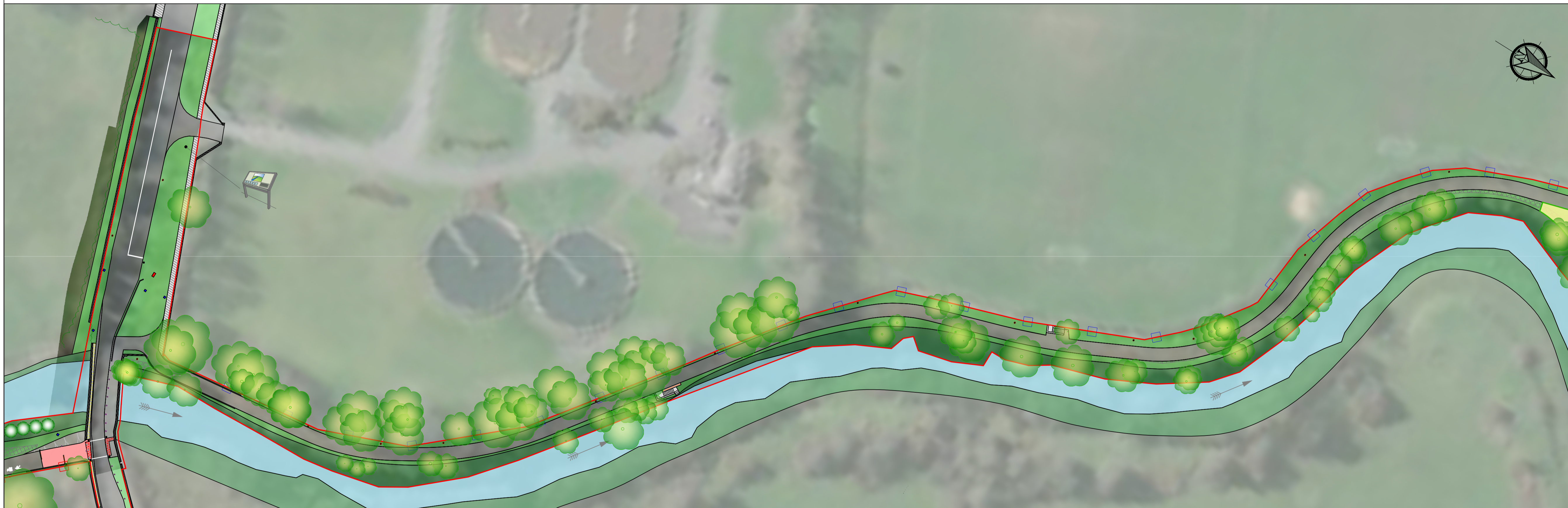
VIEW 2B Scale 1:500