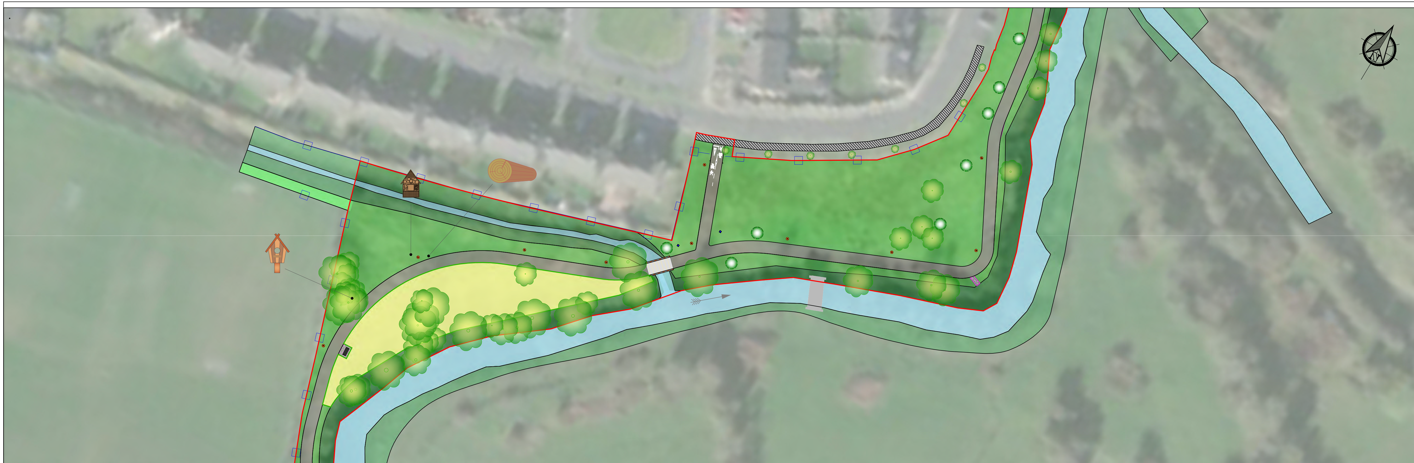
VIEW 3A Scale 1:500