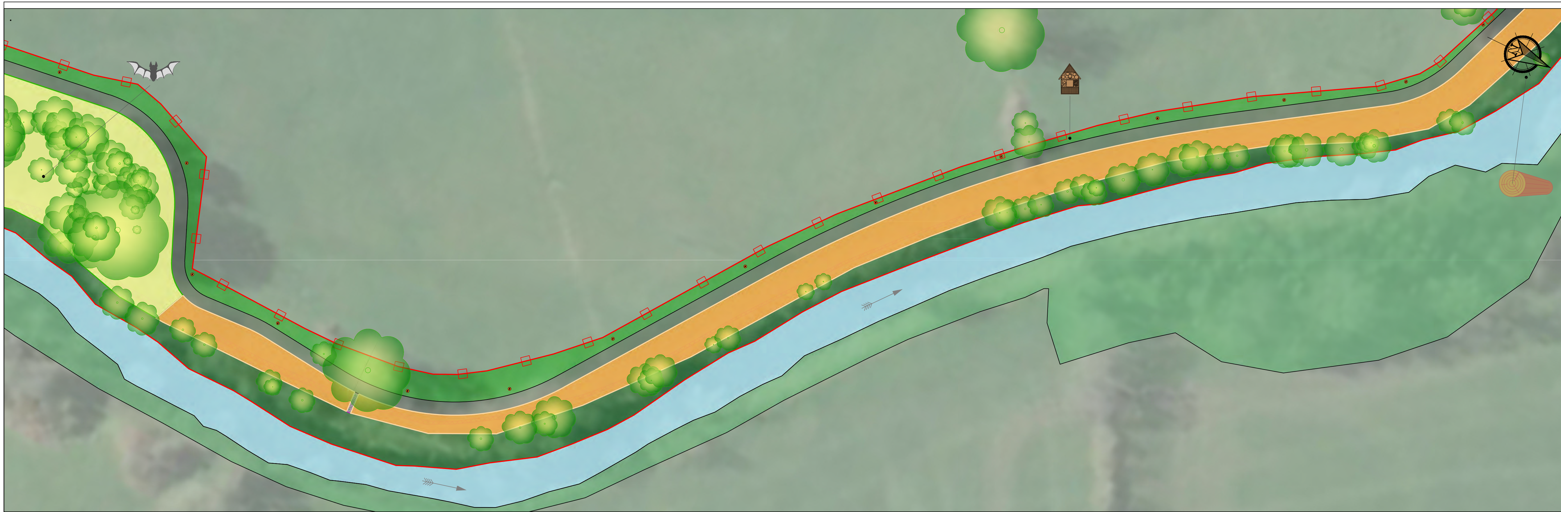
VIEW 4A Scale 1:500