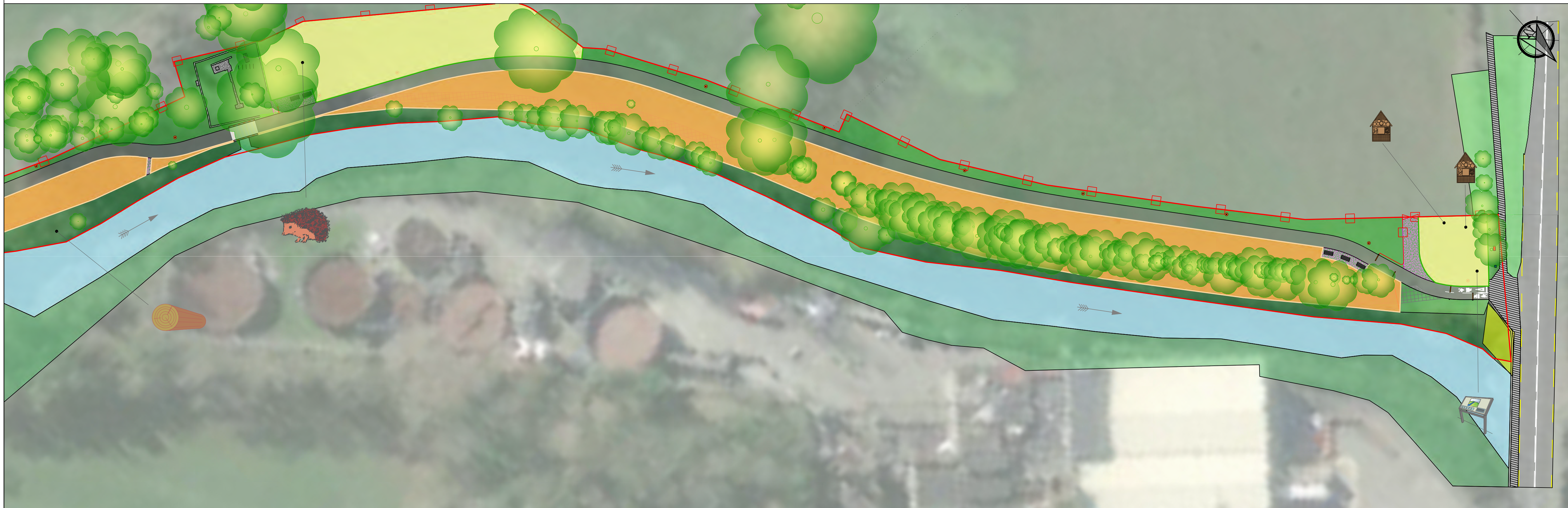
VIEW 4B Scale 1:500