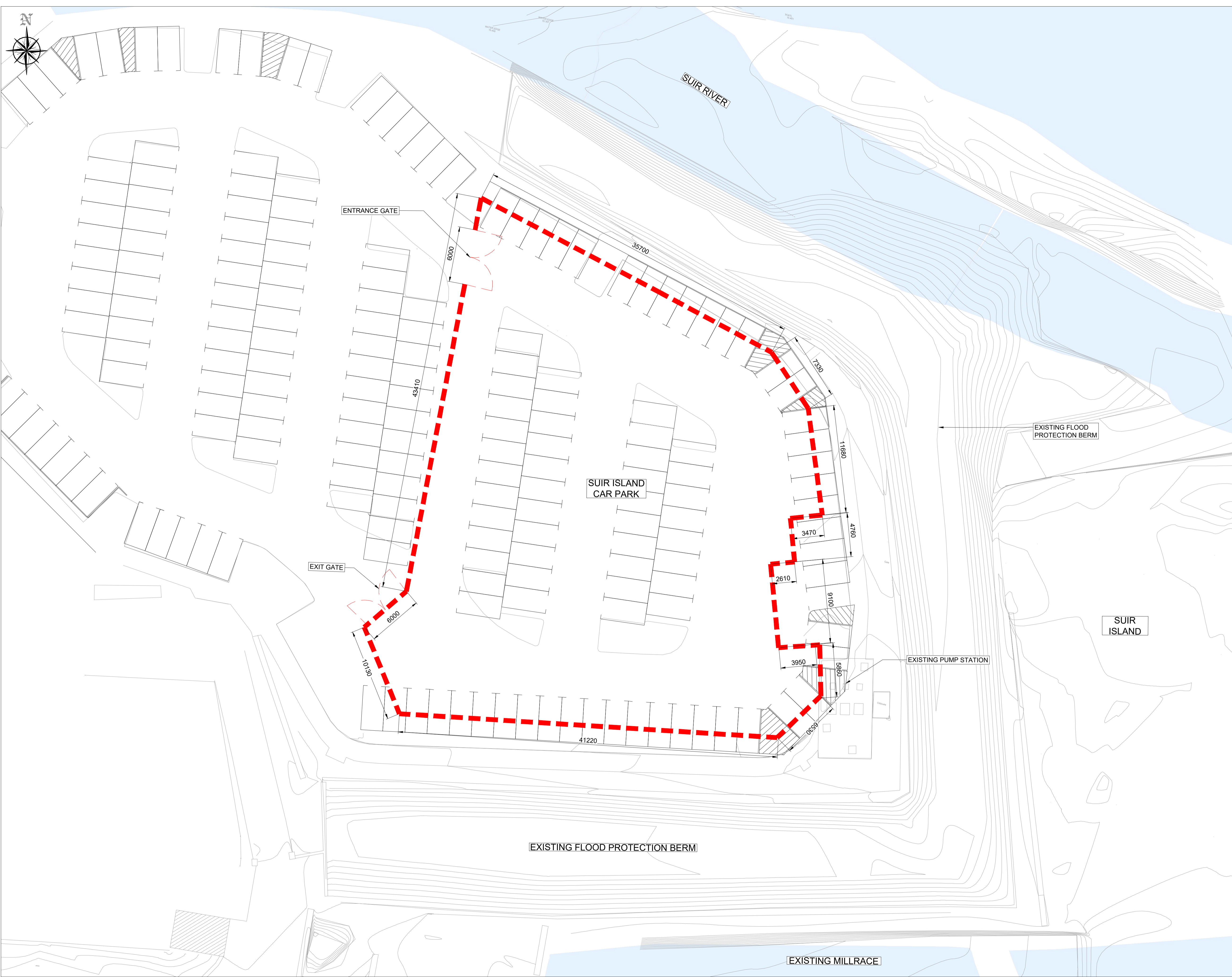
PLAN SCALE 1:200

DRAWING IS PRODUCED USING THE IRISH TRANSVERSE MERCATOR (ITM) GEOGRAPHIC COORDINATE SYSTEM A1