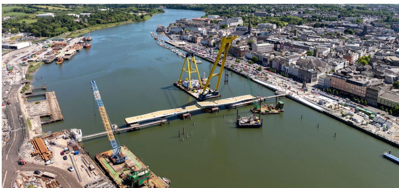
Figure 2: Installation of Sustainable Transport Bridge to North Quays