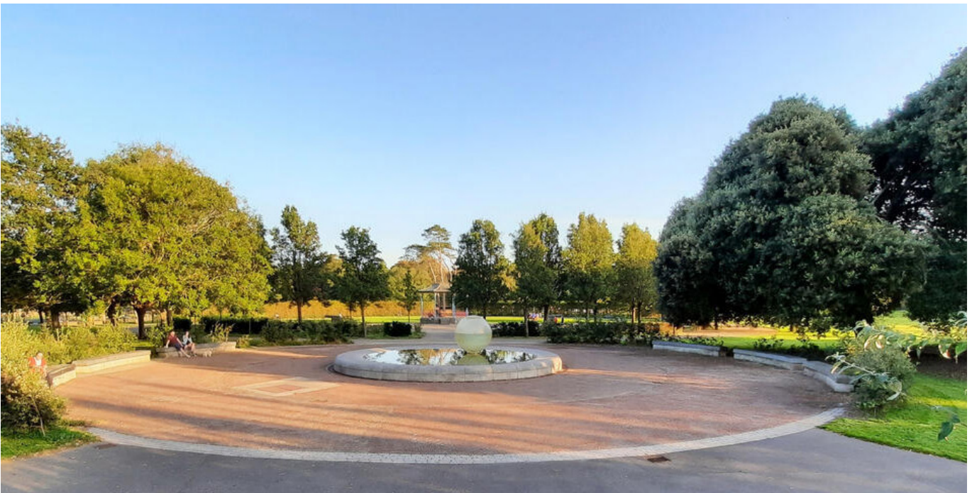
Figure 8: Peace Park