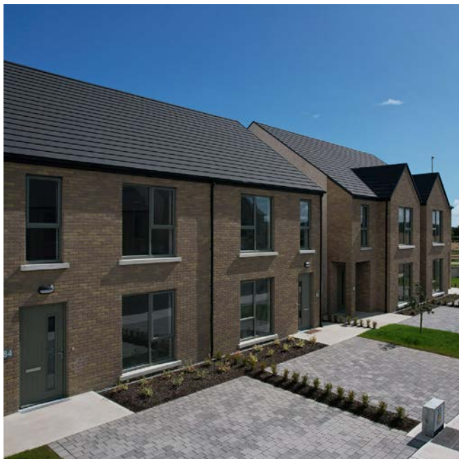
Figure 3: Summerfields Housing Development

Housing Delivery has been behind targets for Waterford City and Suburbs contained in the Development Plans of both Waterford and Kilkenny, achieving only 54% of Core Strategy targets from 2023 to 2025. This contrasts with Waterford City and County as a whole, where housing delivery has been achieving 74% of targets.