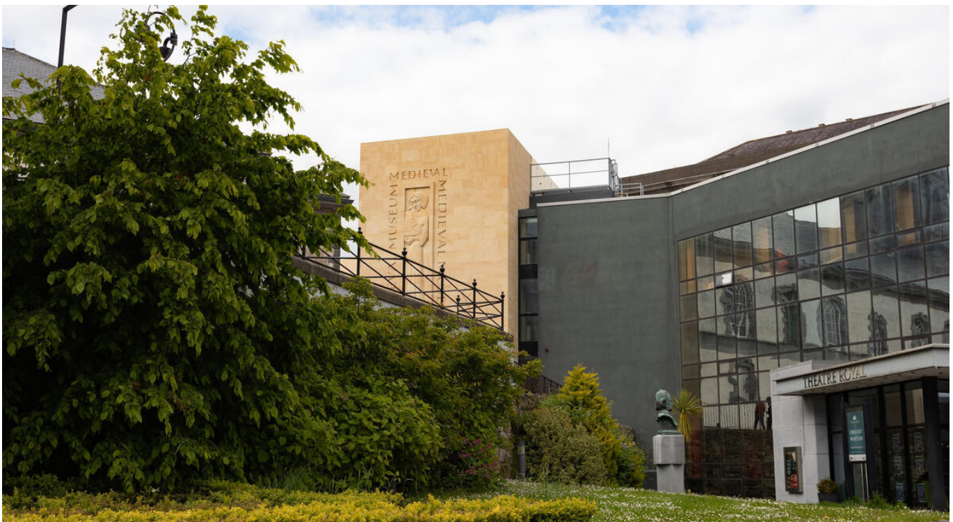
Figure 9: Theatre Royal