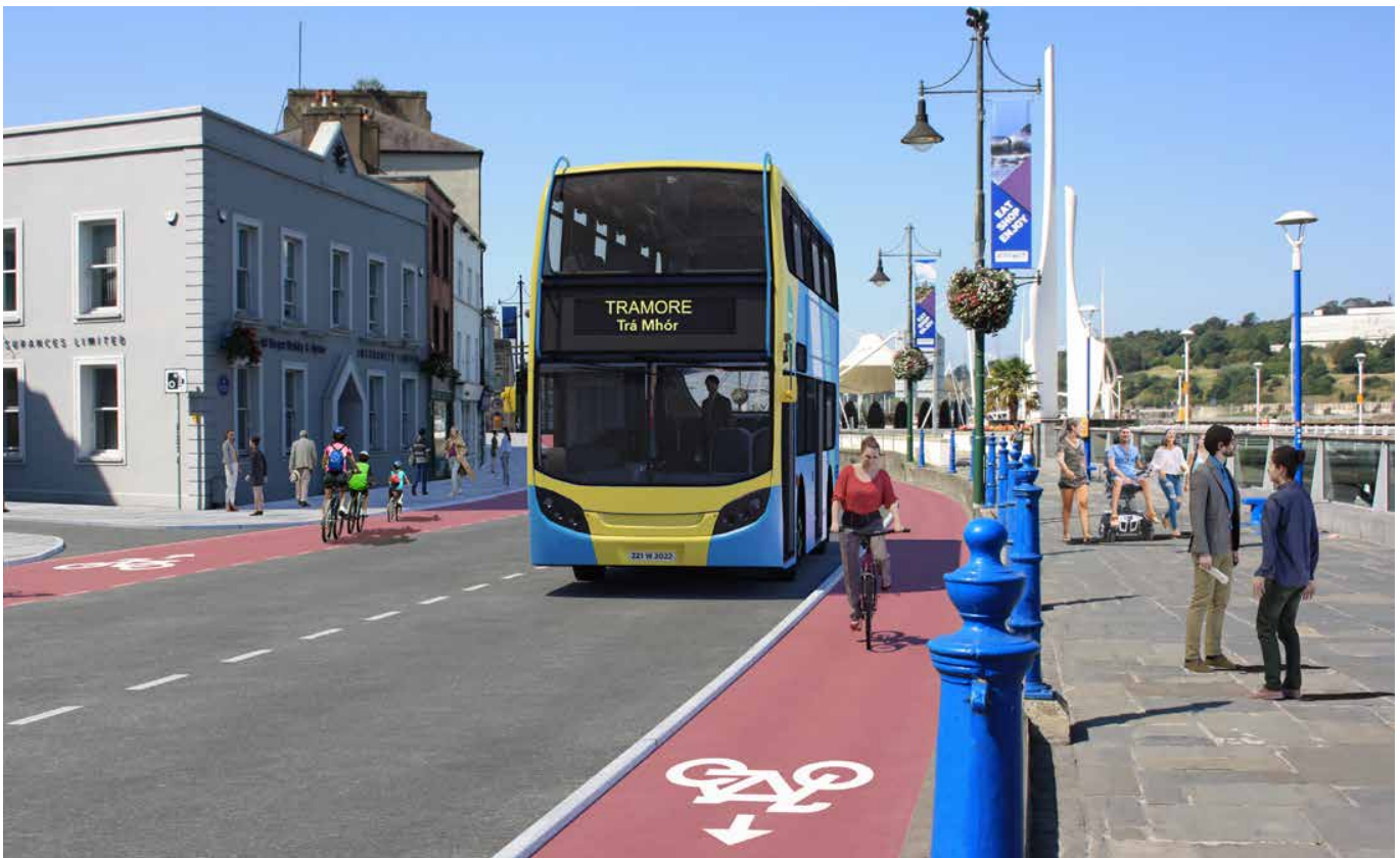
Figure 5: Proposed Transport Improvements, Waterford City