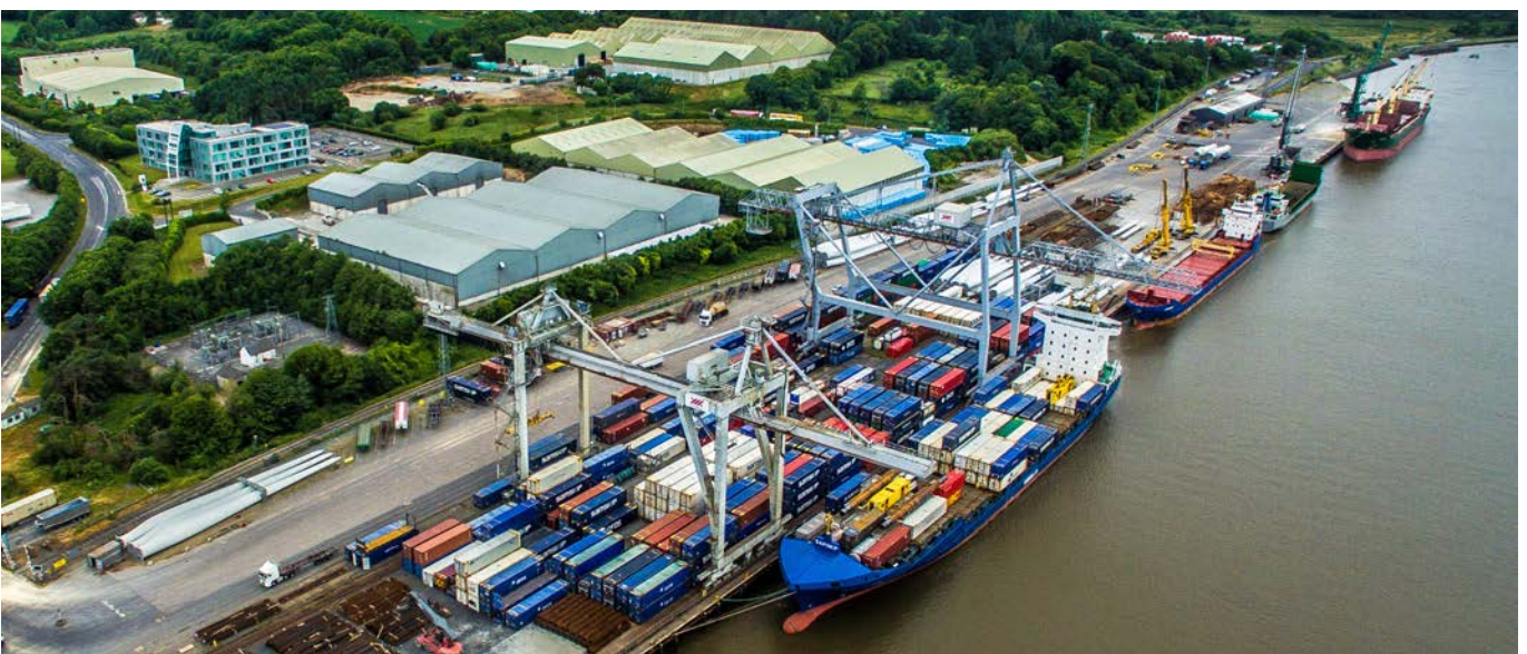
Figure 6: Belview Port