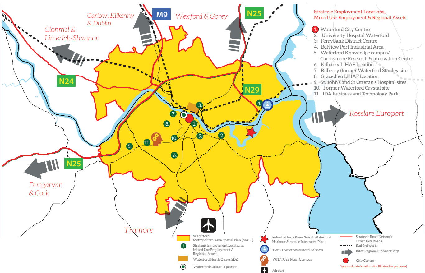
Figure 1: Waterford Metropolitan Area Strategic Plan Map, Current RSES/MASP

Adopted in 2020, the current and first Waterford MASP has operated for the past six years. The MASP has built on previous collaboration between Waterford City & County Council and Kilkenny County Council through the Waterford PLUTS (Planning, Land Use and Transportation Study 2004). The Waterford PLUTS set guiding principles to develop Waterford through a joined-up approach as a Concentric City on both sides of the River Suir, with these principles incorporated into the Waterford MASP.