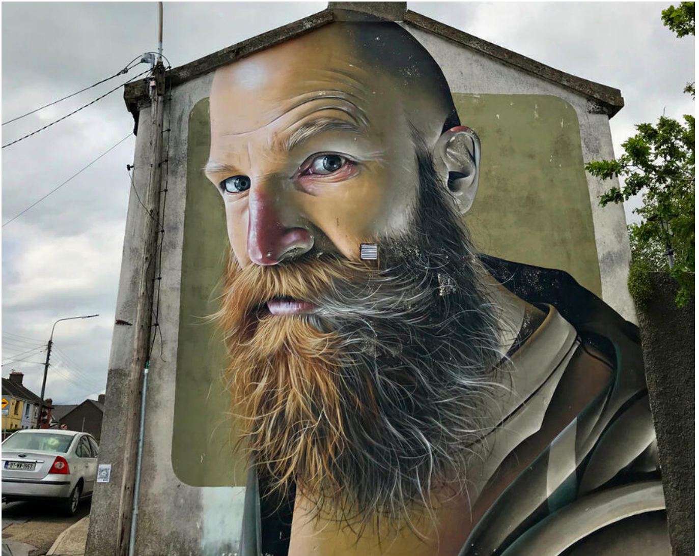
Figure 10: Street Mural, Waterford City

Submissions can be made through the Southern Regional Assemblies dedicated online consultation portal available at: consult.southernassembly.ie , by email to rses@southernassembly.ie , or by post to RSES Submissions, Regional Planning Unit, Southern Regional Assembly, Assembly House, O'Connell Street, Waterford X91 F8PC.