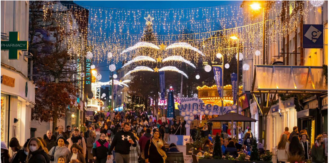
Figure 7: Winterville

There were 23,244 jobs recorded in Waterford City and Suburbs in 2022, which was a 14% increase from 2016, the highest of any city in the state. The unemployment rate of 11.7% (Census 2022) is higher than other cities but is a significant reduction from 18.8% experienced in 2016. Waterford appears to face more significant economic challenges than other economic, with a lower Jobs to Resident Worker Ratio than the other cities. However, data indicates that Waterford is well positioned to benefit from a continued increase in employment and new jobs.